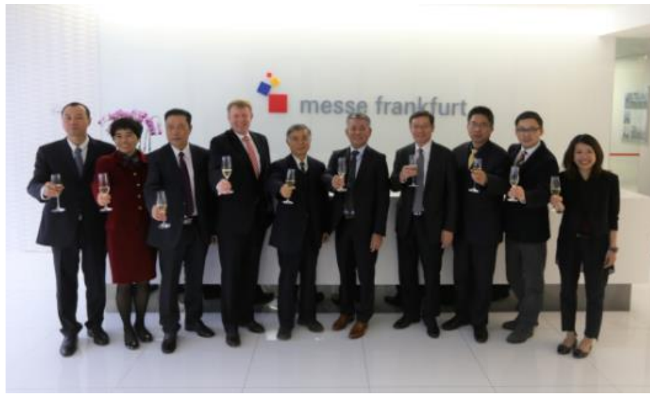
Celebrating for the signing of the new acquisition

Beijing Traders-Link Plus International Exhibition Co Ltd is the organiser of Auto Maintenance & Repair Expo (AMR), held every spring in Beijing, China. The company advocates its expertise and vitality, and implements its local and international networks to AMR. It has successfully made AMR into Asia's biggest and one of the world's top three trade fairs. In its latest edition in 2017, the show's scale expanded to 110,000 sqm of exhibition space and attracted 1,139 exhibitors and 58,212 visits.